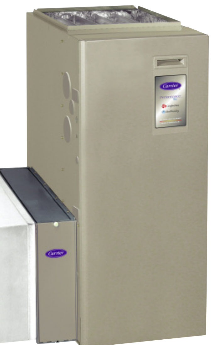
Shown with optional external filter cabinet.