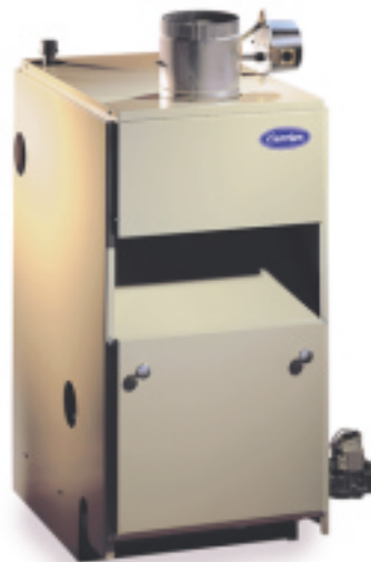
Models BS1 & BS2