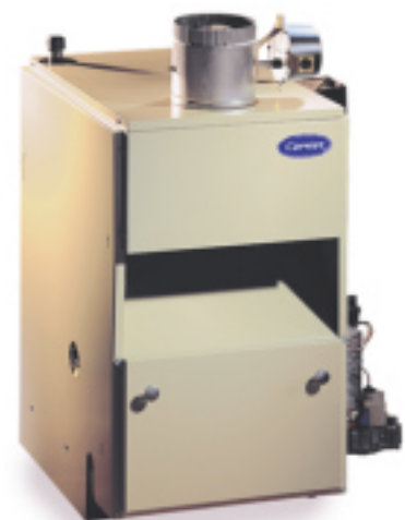
Models BW1 & BW2